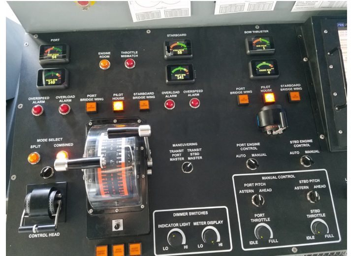
New PanelPilot meters (top) and dimmer switches (bottom middle) in the Pilot House control panel

All components of the new propulsion control system were interconnected in the GBS Lab, and Factory Acceptance Testing performed prior to shipping the system to the vessel in Juneau, Alaska, for installation. After 5 weeks, installation and sea trials were completed, and the ship's force was very pleased with the responsiveness, accuracy, and speed of the new system, allowing the NOAA Fairweather to embark on its Arctic Mission.