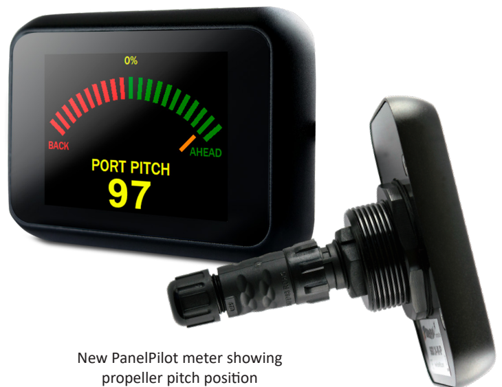
New PanelPilot meter showing propeller pitch position

The ship had four independent control stations; in the pilot house, in both bridge wings and in the engine room. New throttle controls were installed at each for the main propulsion engines and the bow thruster, using a PLC to interface them to the existing propulsion systems. Control panels were also overhauled at each station, and the existing meters used to display data